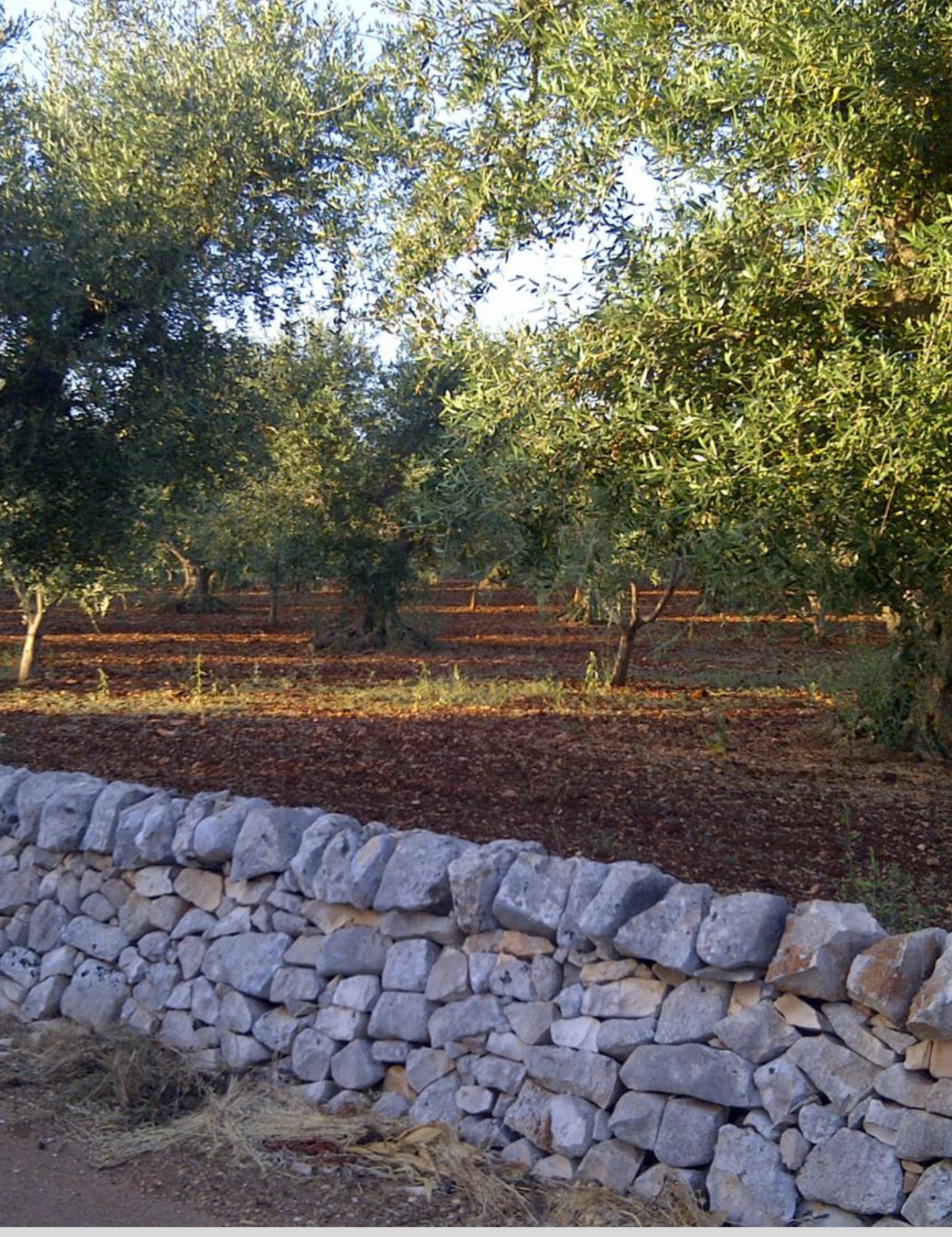
SPSS 2019 "Natural and Human-induced Impacts on the Critical Zone and Food Production"